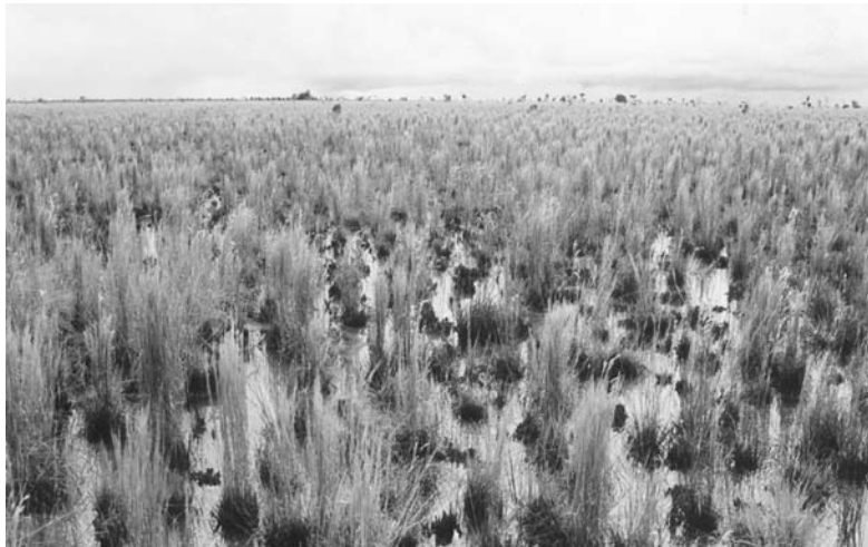
Fig. 2 — Hyperseasonal cerrado in Emas National Park ( 18^{\circ} 18' 07'' S , 52^{\circ} 57' 56'' W ), central Brazil, in February 2003, showing waterlogging.

the size and floristic composition of this vegetation form. We compared the hyperseasonal cerrado with nearby and physiognomically similar areas of seasonal cerrado (approximately 18^{\circ} 17' 34'' S , 52^{\circ} 58' 12'' W ), without waterlogging in the wet season, and floodplain grassland (approximately 18^{\circ} 15' 40'' S , 53^{\circ} 01' 08'' W ), waterlogged throughout the year. In each area, we randomly placed ten 1\text{ m}^2 quadrats and counted the number of individuals of each vascular plant species. We lodged the collected material at the Federal University of São Carlos herbarium.